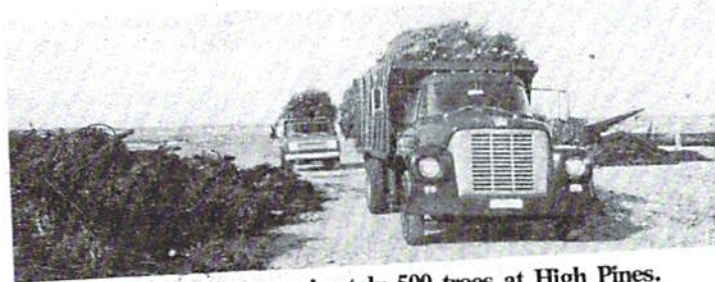
2 trucks with approximately 500 trees at High Pines.